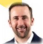
Derek Sloan Former Member of House of Commons

Join us in our support of the doctors fighting against government overreach and for the fundamental rights of all Canadians. Help by donating to this legal process.