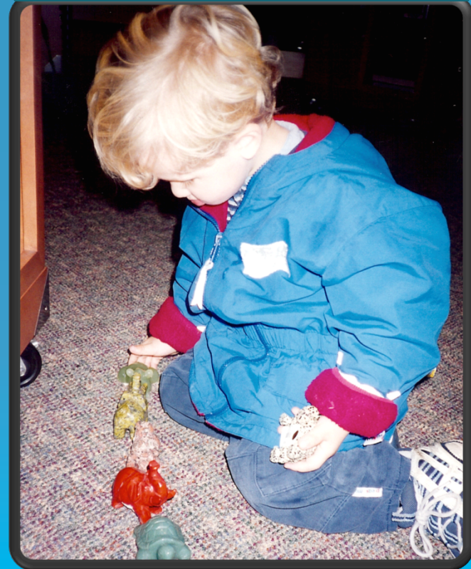
Lining up objects